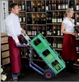
Type 2 212 21 with safety handles and height-adjustable retainer.