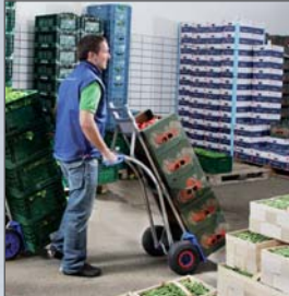
Hand truck Type 2 031 21 is ideally suited for material handling tasks in warehouses.

▶ Any user can move loads with the correct posture by using the height-adjustable CLICK4 handle design.