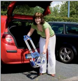
Thanks to 6 cm maximum overall width these hand trucks are storable everywhere.