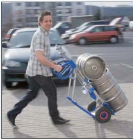
Type 243 212 21+1046 with its hook for transporting KEG drums safely.