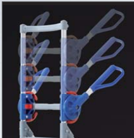
Using the four snap locks, the handles can be adjusted quickly.