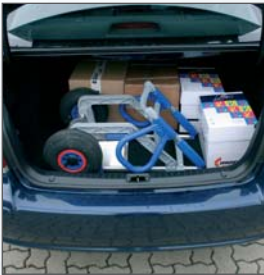
Small, light, useful: The folded hand trucks can be easily stored in a trunk for example.