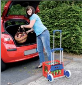
Piccolino family: The compact material handling miracles for leisure, hobby and shopping

► The telescoping struts pull out /in easily at the push of a button. When the footplate is folded downwards, the wheels swing out automatically.