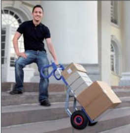
Folding hand trucks facilitates a professional presentation, e.g. while parcel delivery.